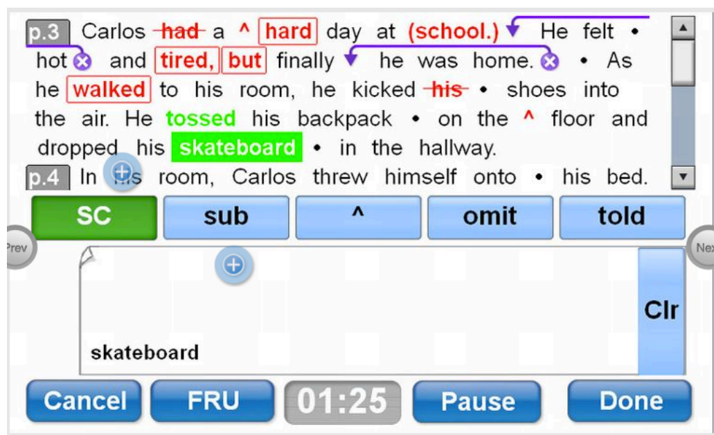
Figure 1. Running Record.

Figure one is an example of what the running record looks like on the iPad.