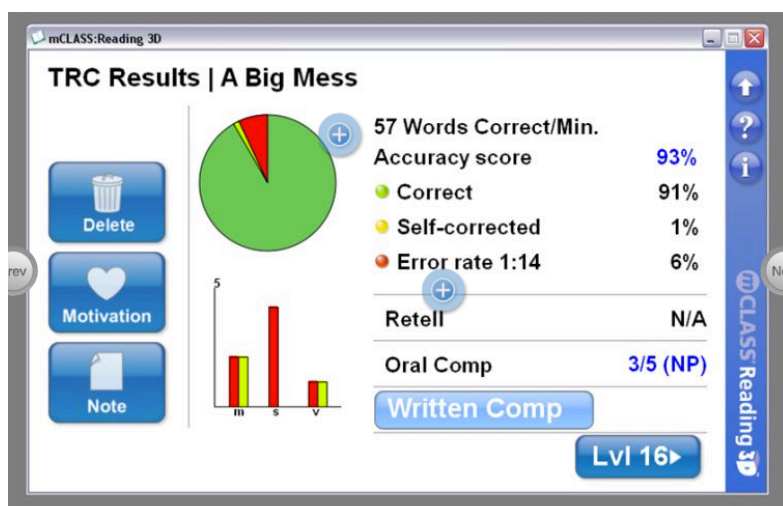
Figure 3. Data Report.

Accuracy ratings fall into one of three categories: below 90 % is too hard for the child and is in the frustrational level, 90 % to 94 % is in the instructional level, meaning that reading of the text requires support from the teacher, 95 % to 100% is too easy for the child or falls in the child's independent reading level, meaning that they can read the book independently without teacher support (Fountas & Pinnell, 1996). If the child completes the reading accuracy at 90% or better along with an average of 2.5 or more on the oral comprehension portion, the child has passed that level. The teacher may then go on to the next level and repeat the same steps. Once the child has not passed a level, a guided reading level is established. For example, if the teacher selected a level G book and the child has passed the level G, the teacher would then move on to a level H book. If the child does not pass the level H book, the child's score would result in a level G.