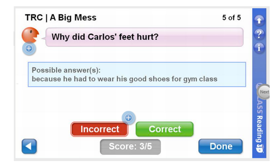
Figure 2. Comprehension Question.

Note . Figure 2 is a sample of comprehension questions from the TRC on the iPad.