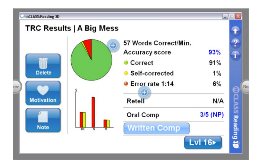
Figure 3. Data Report.

Accuracy ratings fall into one of three categories: below 90 % is too hard for the child and is in the frustrational level, 90 % to 94 % is in the instructional level, meaning that reading of the text requires support from the teacher, 95 % to 100% is too easy for the child or falls in the child's independent reading level, meaning that they can read the book independently without teacher support (Fountas & Pinnell, 1996). If the child completes the reading accuracy at 90% or better along with an average of 2.5 or more on the oral comprehension portion, the child has passed that level. The teacher may then go on to the next level and repeat the same steps. Once the child has not passed a level, a guided reading level is established. For example, if the teacher selected a level G book and the child has passed the level G, the teacher would then move on to a level H book. If the child does not pass the level H book, the child's score would result in a level G.